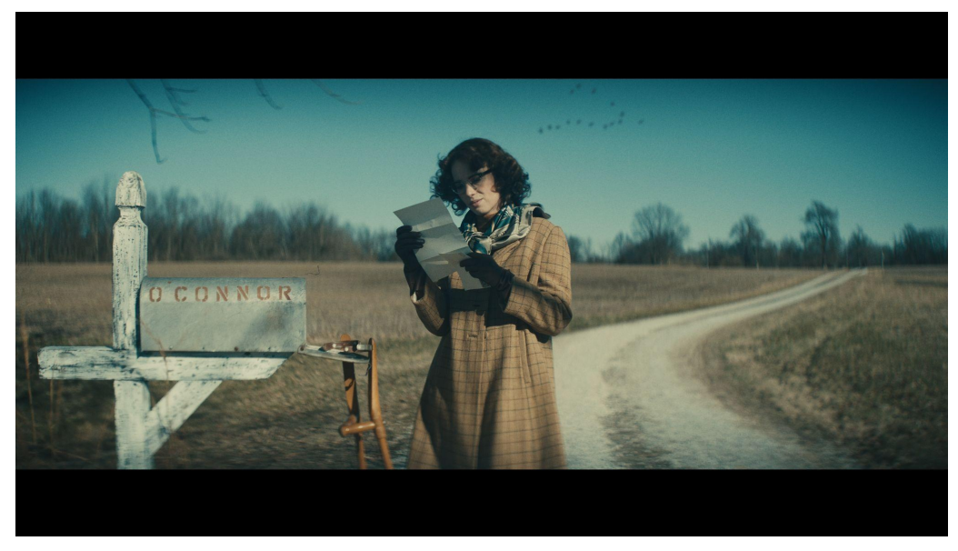
DOWNLOAD MEDIA HERE

Four-time Academy Award® nominee Ethan Hawke will attend two screenings of his 2023 feature Wildcat for post-film Q&A on 5/18 and 5/19